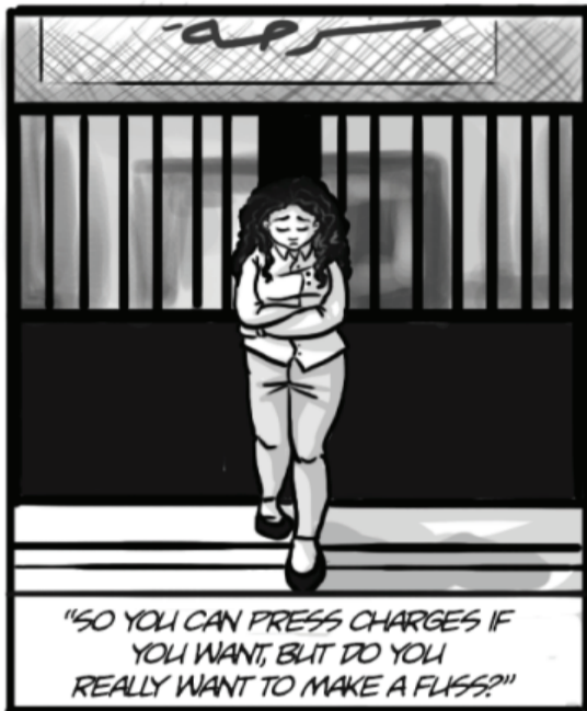
(Qahera, ch. 3)