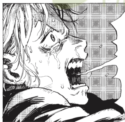
(My Broken Mariko, ch. 1)

Bringing back the justice of abused friend through breaking up her silence.