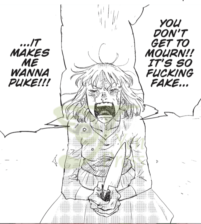
(My Broken Mariko, ch. 1)

Bringing back the justice of abused friend through breaking up her silence.