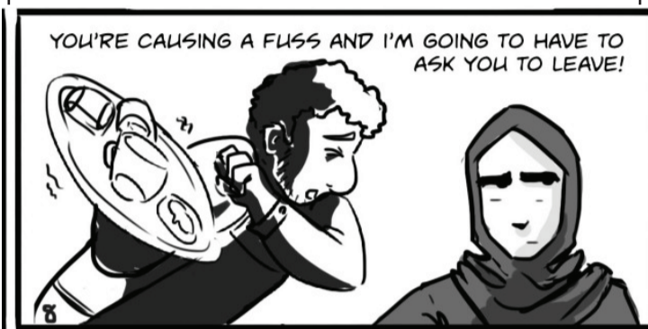
(Qahera, ch. 6)