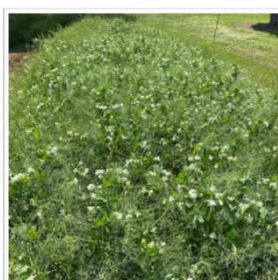
Pea + camelina intercropping

Camelina-pea intercropping resulted in an interesting herbicide-free alternative crop management enabling to increase soil coverage (camelina and pea every other row) while reducing weeds.