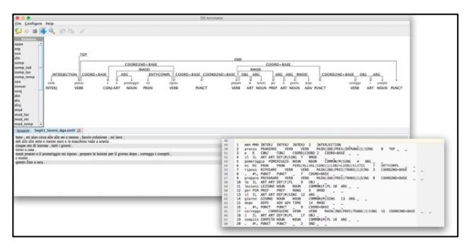
Figure 2: Dependency graph as shown by DGA and full utterance annotation in CoNLL-U format.

software<sup>3</sup> for an easy visualization and correction of TULE mistakes at any level (see figure 2).