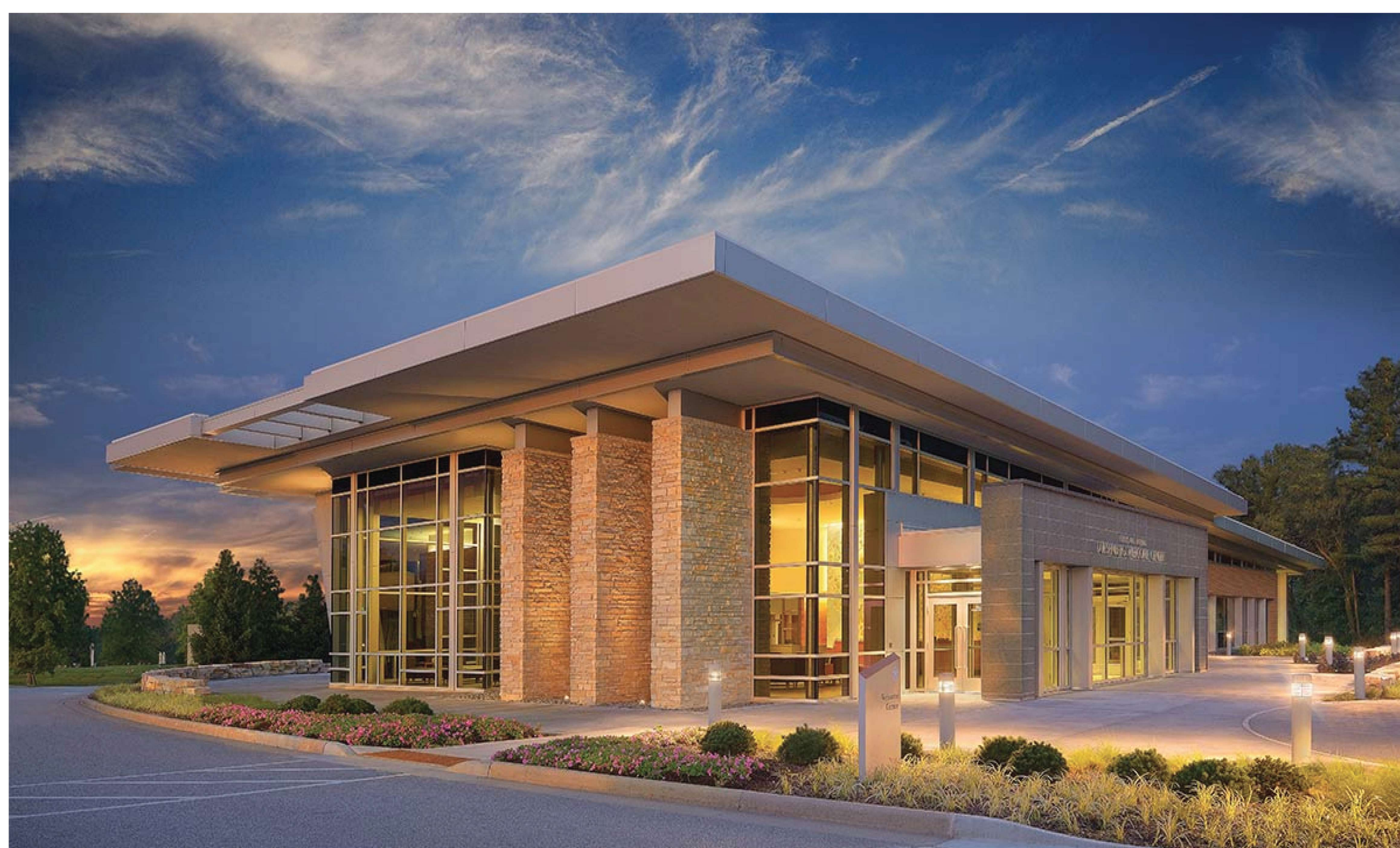
Suggested welcome and information center