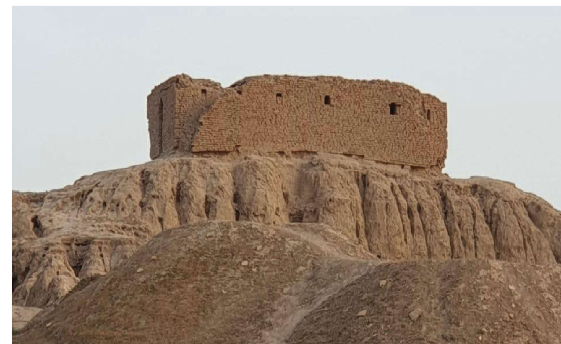
Ruins of a temple platform in Nippur

To conclude, this project is providing a promising opportunity to the unemployed graduate students of Archaeology from University of Al-Qadisiyah to establish a career that is significantly related to their education. It will also contribute to establishing other projects that are in direct contact with the lives of the people of Afaq. A major expansion in the archaeological activities could also be enhanced through such activities.